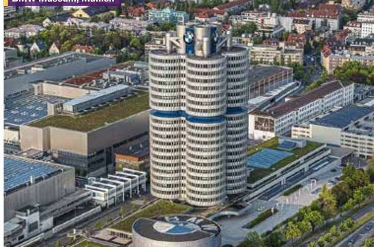
BMW Museum, Munich