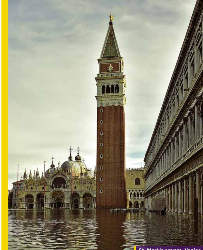
St. Mark's square, Venice