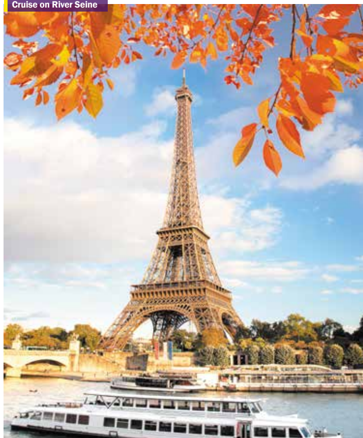
Cruise on River Seine