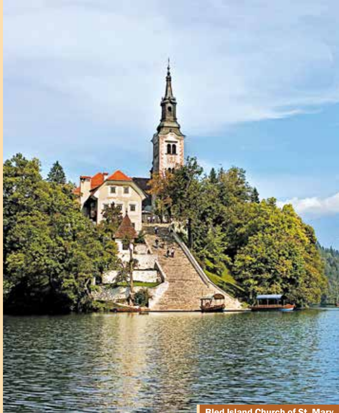
Bled Island Church of St. Mary