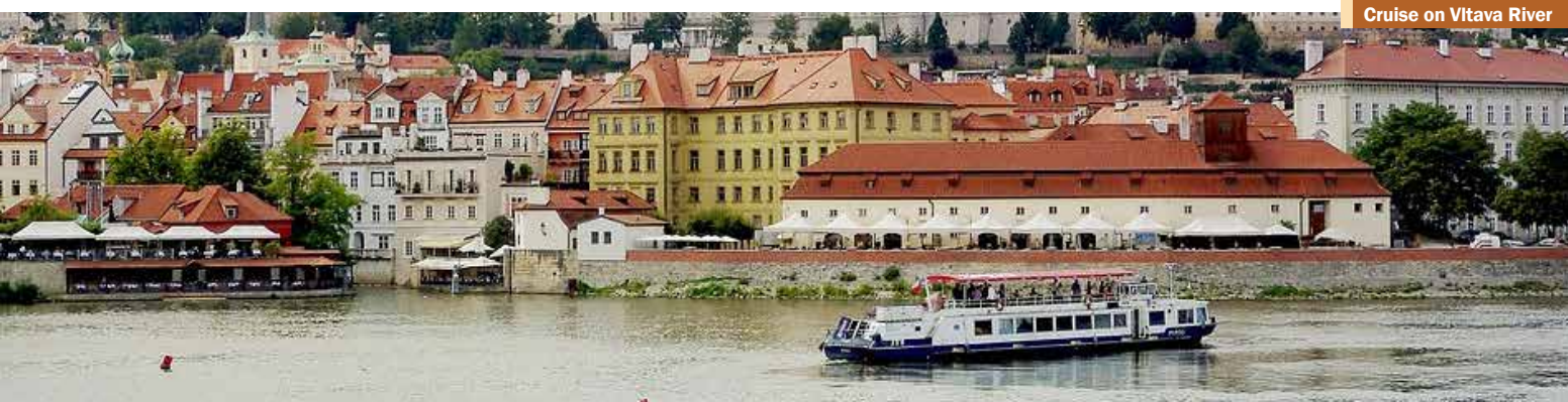
Cruise on Vltava River

(Abbreviation - B: Breakfast, L: Indian Lunch, LL: Local Lunch, PL: Packed Lunch, D: Indian Dinner, LD: Local Dinner)