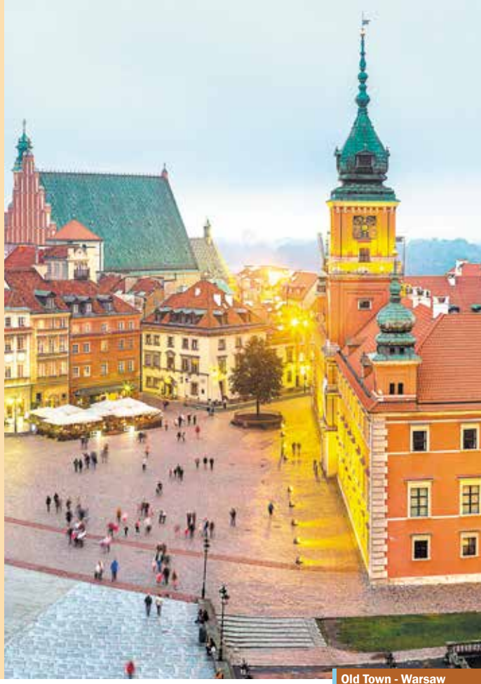
Old Town - Warsaw