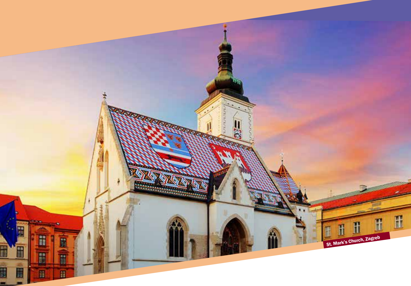
St. Mark's Church, Zagreb