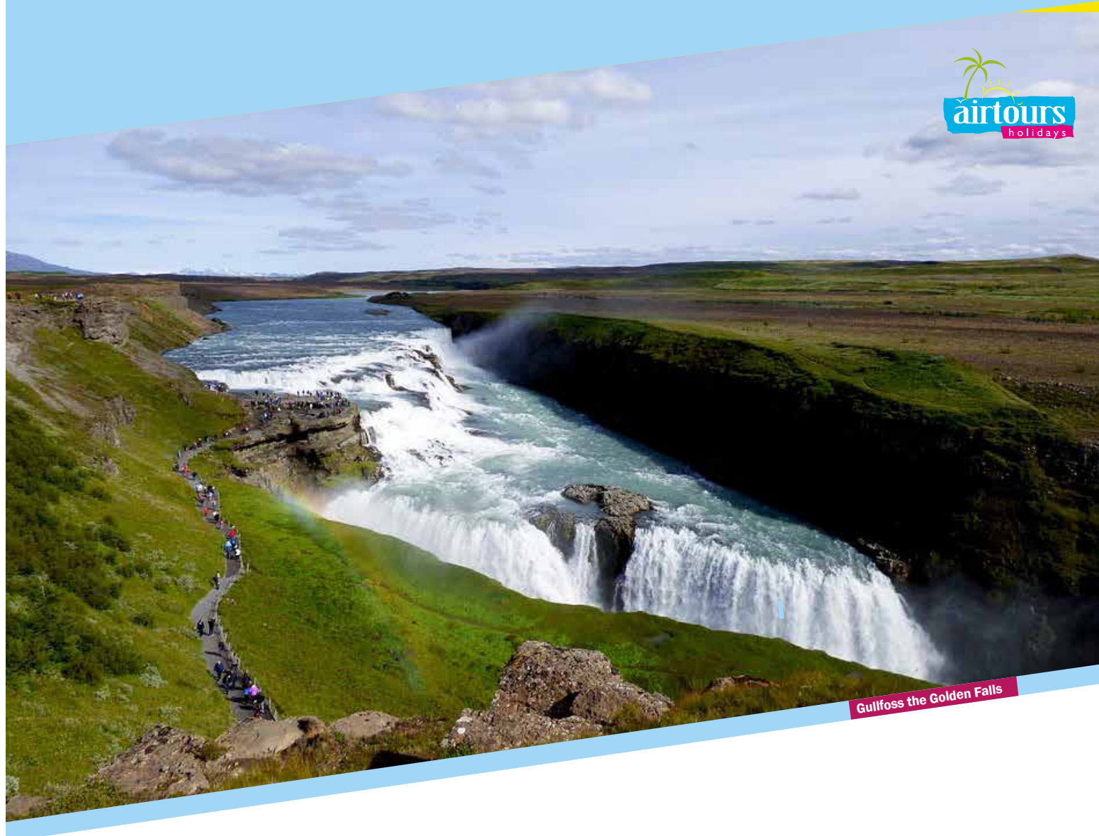
Gullfoss the Golden Falls

results of the continents drifting apart is clearly visible in the landscape. It is also a place of great historical importance being the site of the ancient Icelandic parliament, Alþingi, which was established in 930 AD. At the geothermal area of Geysir there are several different hot springs, amongst them the very active Strokkur which sends a column of boiling water high into the air every 6-10 minutes. Gullfoss is a majestic waterfall in the Hvítá river which in two stages plunges more than 30 meters into a deep crevice. It is by many considered one of the most beautiful waterfalls in the country. Buffet local lunch en route at the Tomato Farm. Tour of the Tomato Farm. Tonight enjoy an Indian dinner.