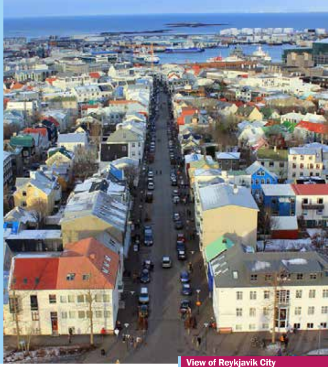
View of Reykjavik City