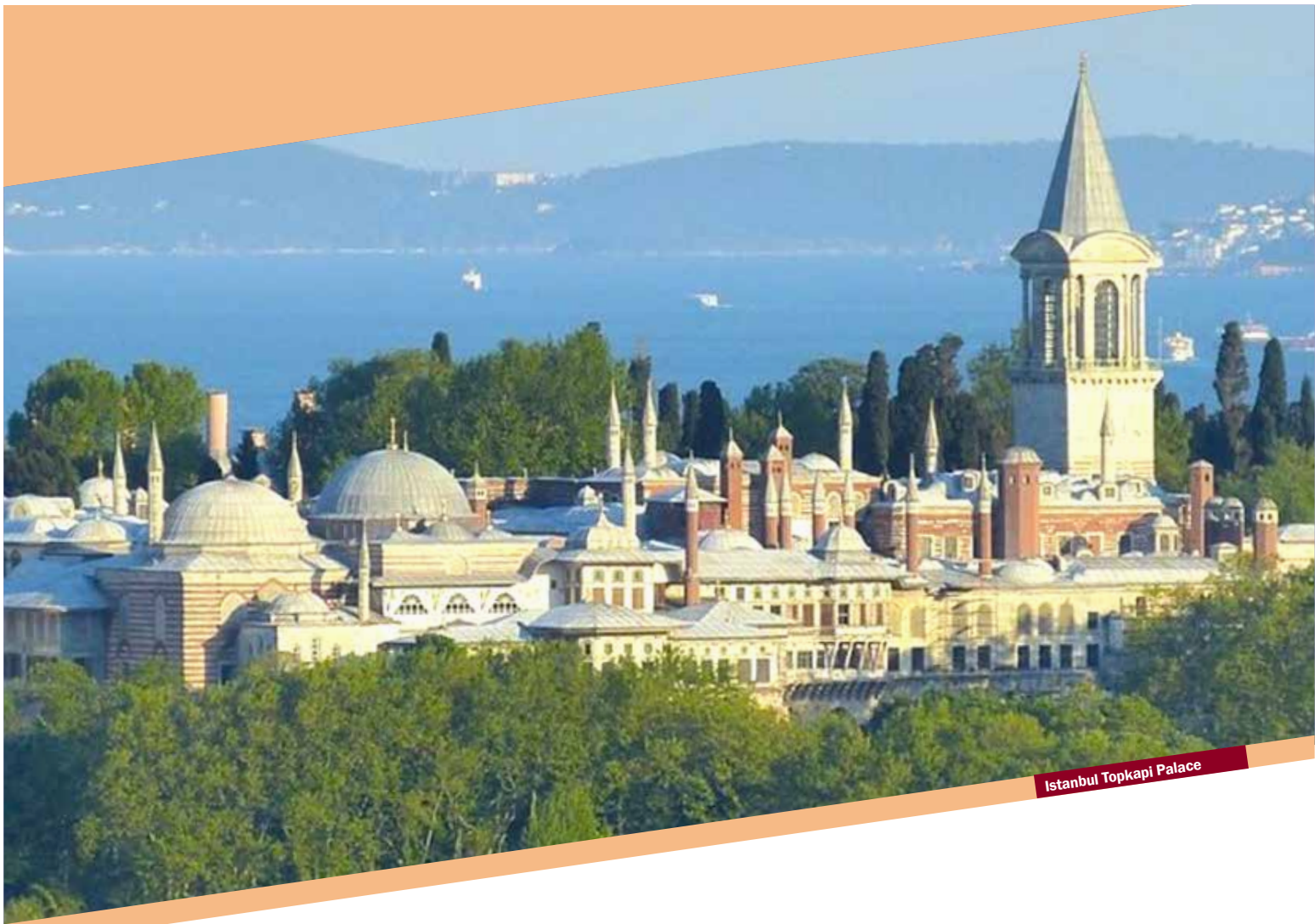
Istanbul Topkapi Palace