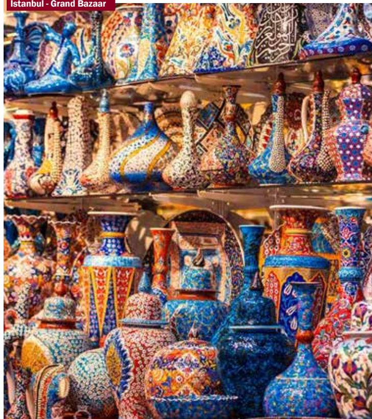
Istanbul - Grand Bazaar