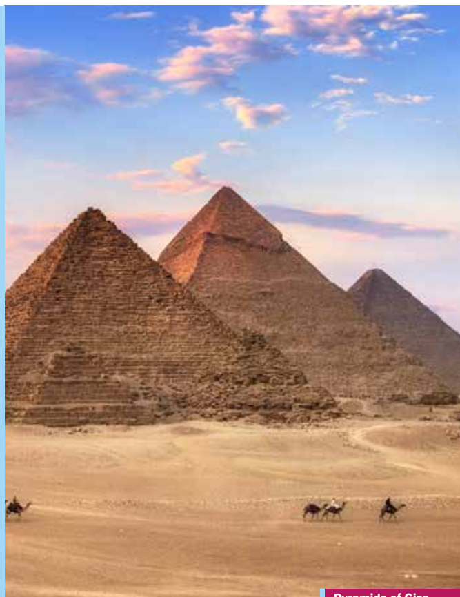
Pyramids of Giza