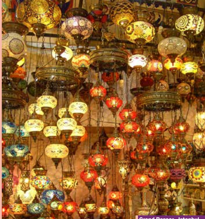
Grand Bazaar - Istanbul

Serpent Column taken from Delphi by Constantine. Also visit the Blue Mosque (closed to visit on Friday morning due to Friday prayers), which has five main domes, six minarets and eight secondary domes. [Please note, Blue Mosque is under renovation due to which it will be visited from outside only] . Later visit the Spice Market. Enjoy an Indian dinner Overnight in Istanbul. (B, LL, D)