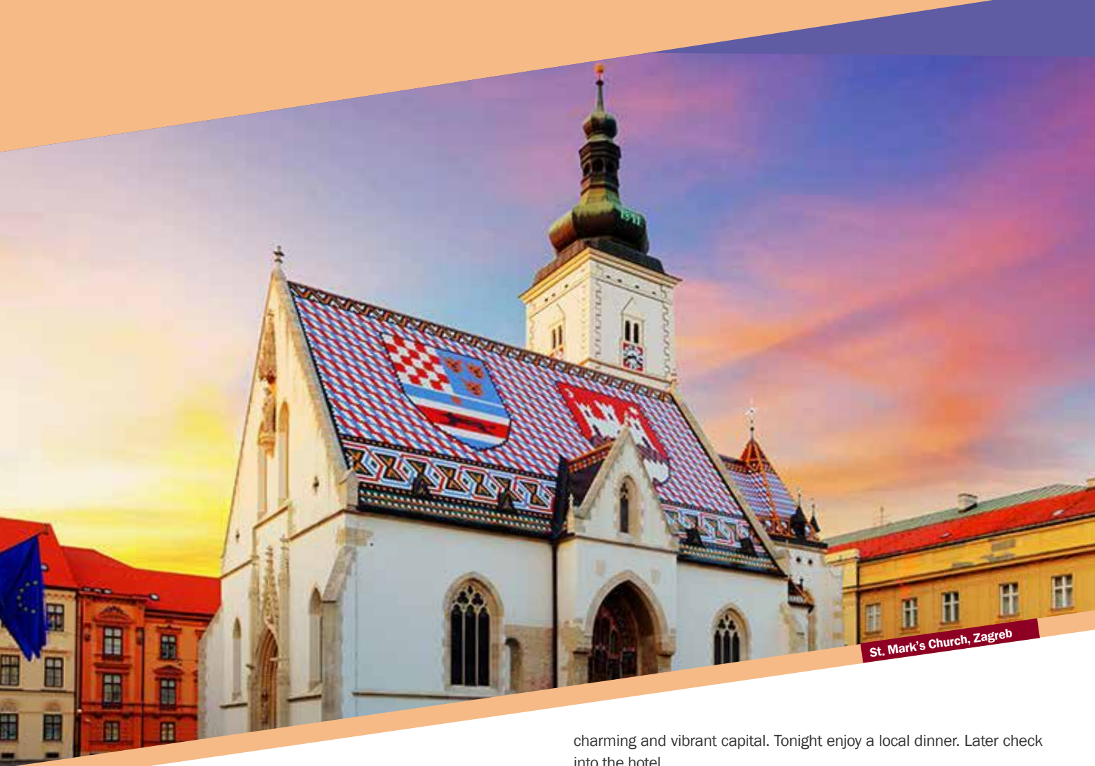
St. Mark's Church, Zagreb

charming and vibrant capital. Tonight enjoy a local dinner. Later check into the hotel.