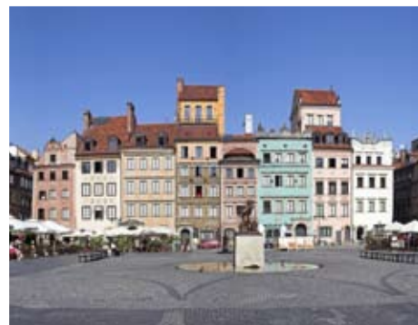
Market Square – Warsaw