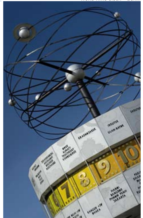
World Time Clock – Berlin

After buffet/boxed breakfast, depart for the airport (on your own) for your flight back home. Return home with great experiences and memories of your holiday with Airtours Holidays.