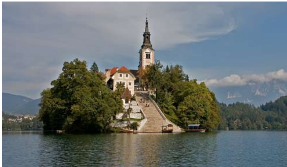
Bled Island – St. Mary Church

After a buffet breakfast at the hotel, check