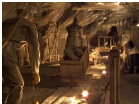
Salt Mine Wieliczka – Krakow