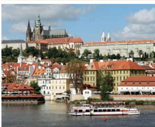
Vltava River Cruise – Prague