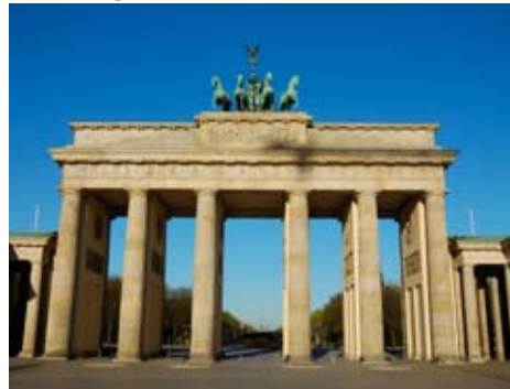
Brandenburger Gate – Berlin

Tonight, enjoy an Indian dinner. Overnight at hotel Berlin Berlin/Abba/Marriott or similar, in Berlin.