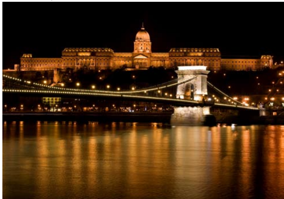
Buda Castle – Budapest.

Overnight at hotel Hilton Westend/Novotel/Mercure or similar, in Budapest.