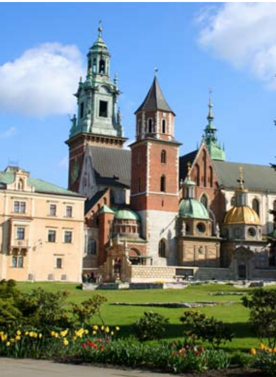
Wawel Castle – Krakow

English speaking local guide to see this beautiful city. See the Main Market Square with St. Mary's Basilica and the Sukiennice Cloth Hall, the Wawel Castle, the National Art Museum, the Zygmunt Bell at the Wawel Cathedral, and the medieval St Florian's Gate with the Barbican along the Royal Coronation Route.