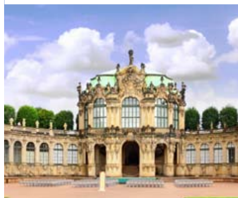
Zwinger Palace – Dresden