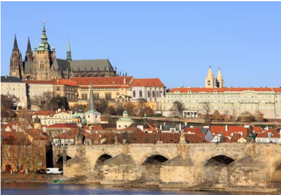
Prague Castle and Charles Bridge

This evening, proceed for a dinner cruise on the Vltava River with a local guide. Overnight at hotel Majestic/Jury's Inn/Diplomat or similar, in Prague.