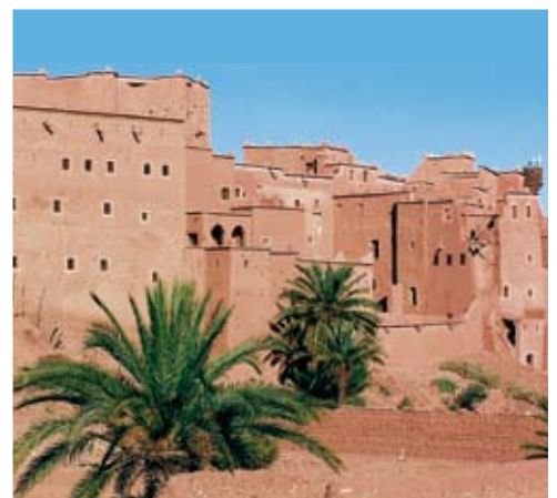
Kasbah - Tangiers