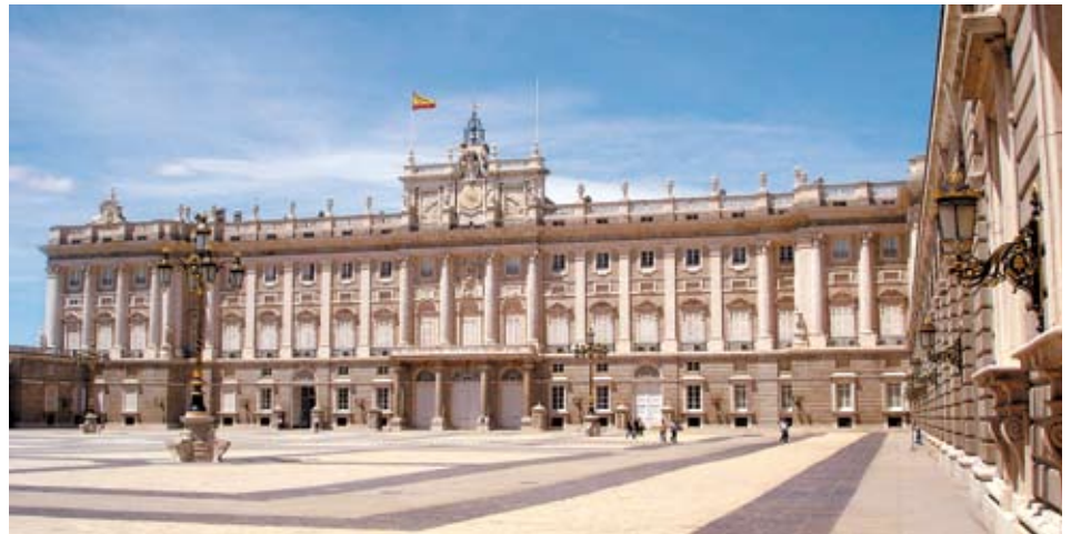
Royal Palace - Madrid

Visit the Casa Mila - an expressionist and unconventional apartment block created by Gaudi. It breaks traditional architecture by not using a single straight line. Later visit the Spanish Village - laid out for the 1929 World