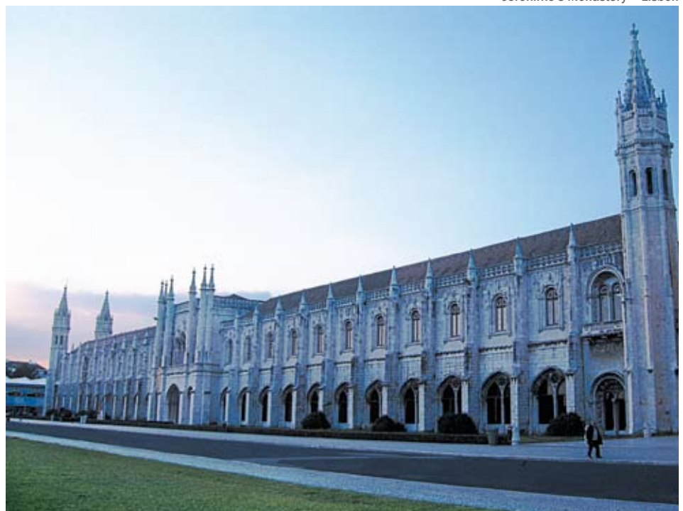
Jeronimo's Monastery - Lisbon

Overnight at hotel Zuriqe or similar, in Lisbon.