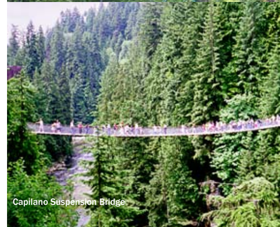
Capilano Suspension Bridge