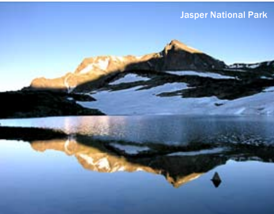
Jasper National Park

Calgary, Banff, Jasper, Kamloops, Vancouver and Alaska