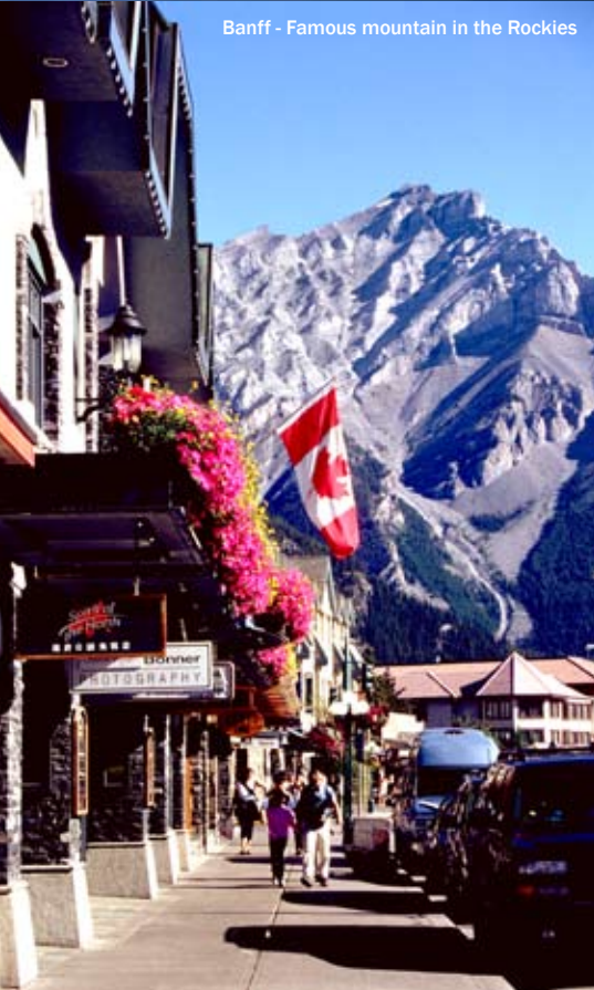
Banff - Famous mountain in the Rockies