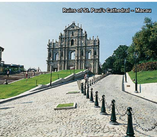
Ruins of St. Paul's Cathedral - Macau