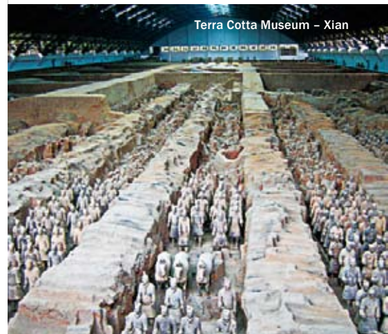
Terra Cotta Museum - Xian