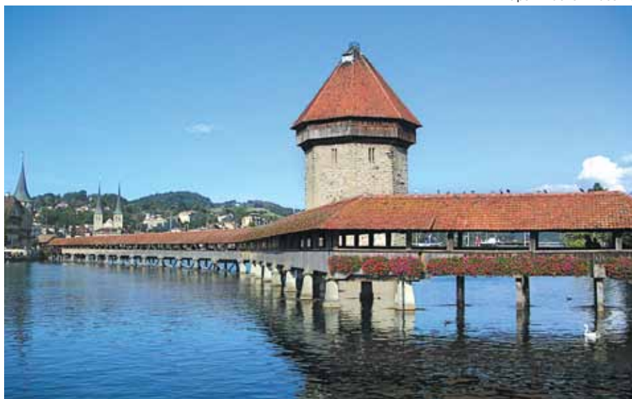
Kapell Brücke – Lucerne

Zurich – The Commercial Capital. City tour of Zurich.