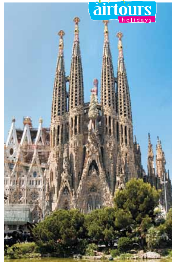
Sagrada Familia – Barcelona

After a buffet breakfast at the hotel, check out and proceed to the airport for your