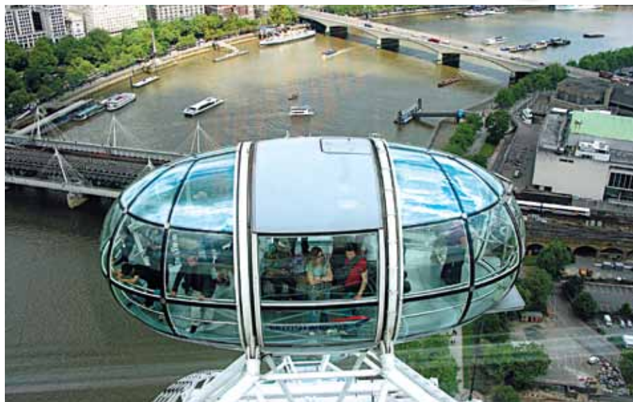
Aboard the London Eye