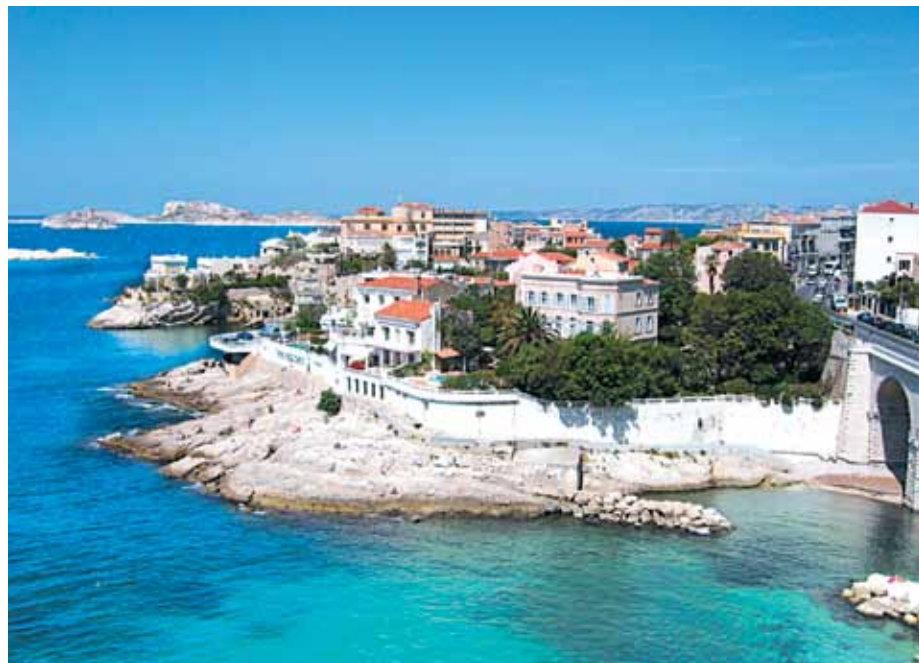
Marseilles - France

Later drive to the city of Pisa. Visit the "Square of Miracles" and see the precariously Leaning Tower of Pisa. After a fun filled day return back to your cruise. The rest of the evening is free at leisure.