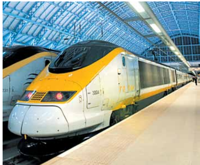
Ride the Eurostar to Paris

exhibits which have never been exhibited in the UK in the past. Also enjoy time at leisure on the world famous Oxford Street. Tonight, enjoy an Indian dinner.