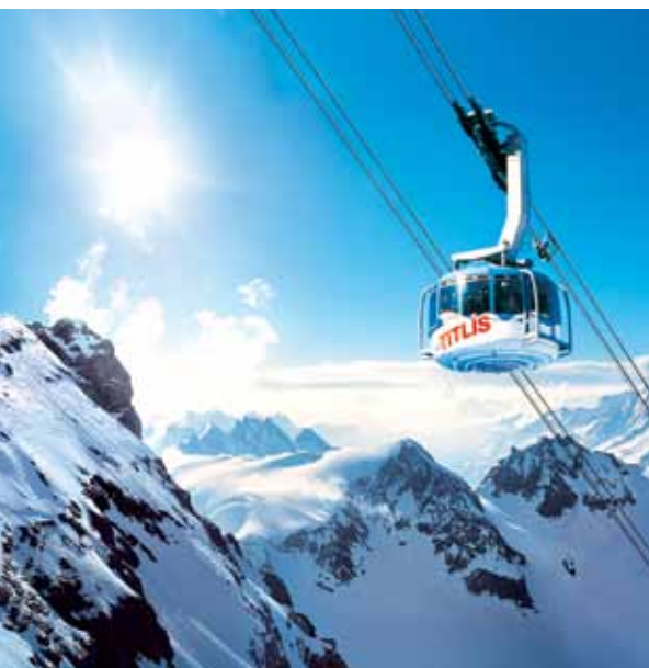
Rotair - Mt. Titlis

After a buffet breakfast, check out and proceed to the romantic city of Venice. Board your chartered boat to the traditional centre of the city - Piazza San Marco. Today, enjoy an Indian lunch on board your chartered boat. This city of 117 islands in the Venetian Lagoon is sure to leave you mystified. See the St. Mark's Basilica, Bridge of Sighs, the Doges Palace, the Campanile and many more sights. Experience the romance of this magical city on a Gondola ride - included on your tour. Visit a Murano