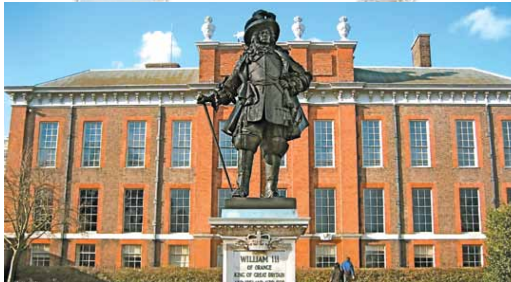
Kensington Palace – London