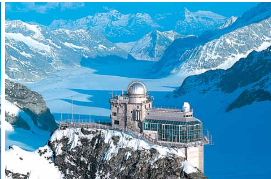
Jungfrauoch - Top of Europe, Switzerland

After a buffet breakfast at the hotel, proceed for an excursion that will surely leave you spellbound. Enjoy stunning views from the world's first revolving cable car - Rotair on your way up to Mt. Titlis (3020 mts). Here visit the Ice Grotto and