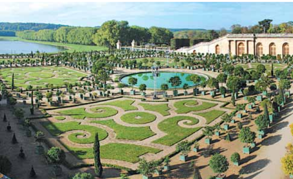
Magnificent Versailles Palace Gardens

This evening, live the Parisian highlife