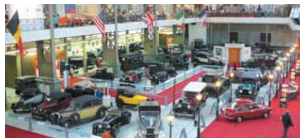
Auto World - Brussels

animals and lots of recreational fun. Later, drive to Switzerland to see one of Europe's natural wonders - The spectacular Rhine Falls in Schaffhausen. Next, proceed to Flawil to visit Schoggi Land at Maestrani Chocolate Factory. During your tour, discover the art of making chocolates and taste a wide variety of delicious Swiss chocolates. Continue your journey into Switzerland with a visit to the Financial Capital - Zurich. On arrival, enjoy an Indian lunch. Next, proceed on an orientation tour of this bustling and charming city.