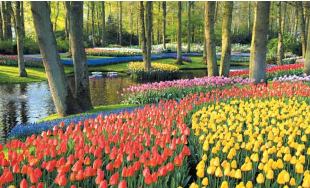
Keukenhof - Lisse, Netherlands

After a buffet breakfast, check out and visit the Schwarzwaldpark - a Black Forest Wild Life Park. A big game and leisure park which is located in the Black Forest Nature Park. In the midst of this green oasis you see in approximately 40 acres of nature,