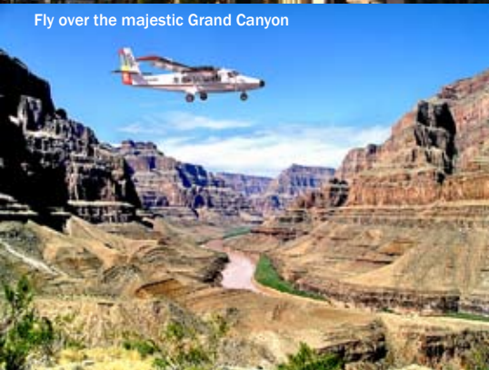
Fly over the majestic Grand Canyon

enjoy a spectacular Broadway-style Show on board.