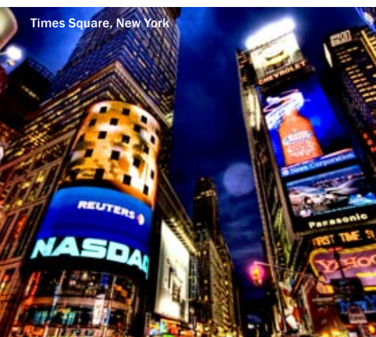
Times Square, New York

Onto Washington D.C. Visit the Smithsonian Air and Space Museum. Guided city tour.