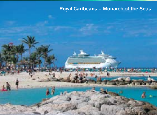
Royal Caribbeans – Monarch of the Seas