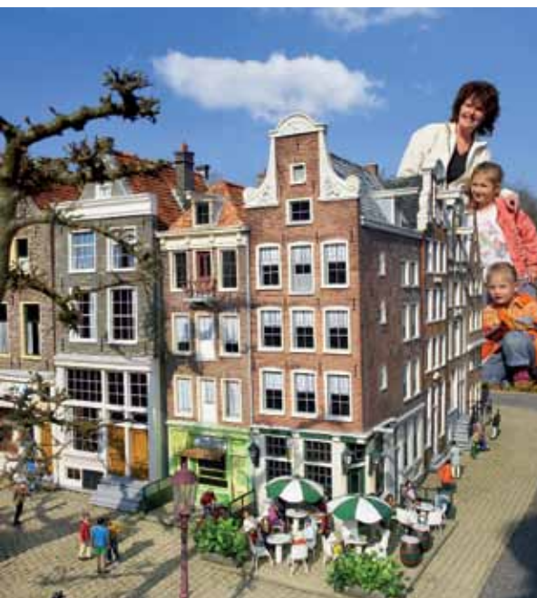
Madurodam – Holland in Miniature

After a buffet breakfast, check out and experience a natural wonder as you drive through the mystical Black Forest in Germany, synonymous with the Black Forest Cake and home to the Cuckoo Clocks. Experience the world of Cuckoo Clocks during an interesting demonstration in Drubba. After an Indian/local lunch, drive to Schaffhausen to view one of Europe's natural wonders – The spectacular Rhine Falls. Continue your journey into Switzerland arriving into the beautiful lakeside town of Lucerne. See the dramatic Lion Monument and the Kapell Brücke as you soak in the beauty of this city. Enjoy a cruise on the lake of the four cantons - Lake Lucerne. You also have some free time for shopping of the world