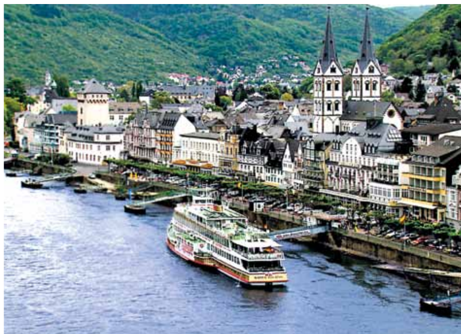
Rhine River Cruise – Germany

Holland in miniature where you see all of Holland's important sights built on a 1:25 scale. Next, depart for Brussels. On arrival, proceed on an orientation tour of Brussels. Visit the Grand Place - one of the prettiest squares in the world. See the unique Statue of Mannekin Pis - symbolic to this city. Later, make a photostop at the Atomium - symbol of Brussels.