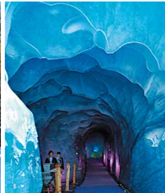
Mer De Glace – Chamonix Valley

Guided city tour of Paris. Visit the 3rd level of the Eiffel Tower. Visit the Fragonard Perfume Museum. Visit the Louvre Museum. Enjoy a Cruise on the