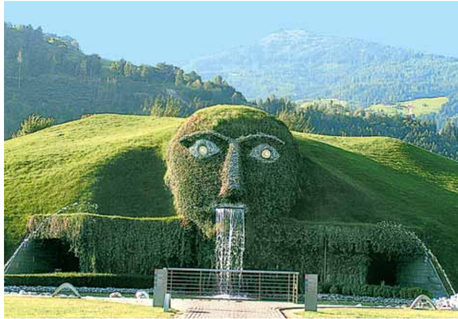
Swarovski Crystal World – Wattens, Austria

check out and proceed for an excursion that will surely leave you spellbound. Enjoy stunning views from the world's first revolving cable car - Rotair on your way up to Mt. Titlis (3020 mts). Here visit the Ice Grotto and indulge yourself in the world of snow on the snow terrace. After lunch, drive to the charming Principality of Liechtenstein. On arrival into Vaduz, enjoy some time at leisure around this quaint