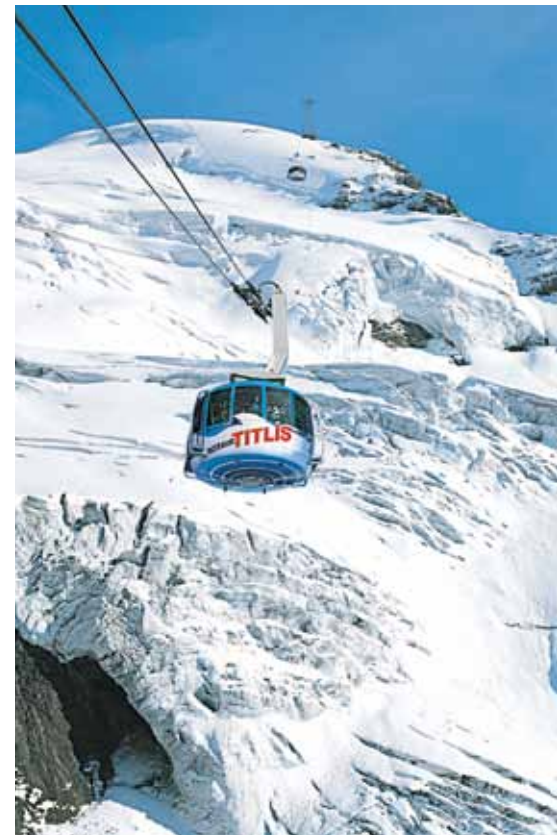
Rotair Mt. Titlis

Later, drive to Florence. On arrival, proceed on a guided tour of this beautiful city. See the Basilica di Santa Maria del Fiore - The Duomo, the Baptistry with the