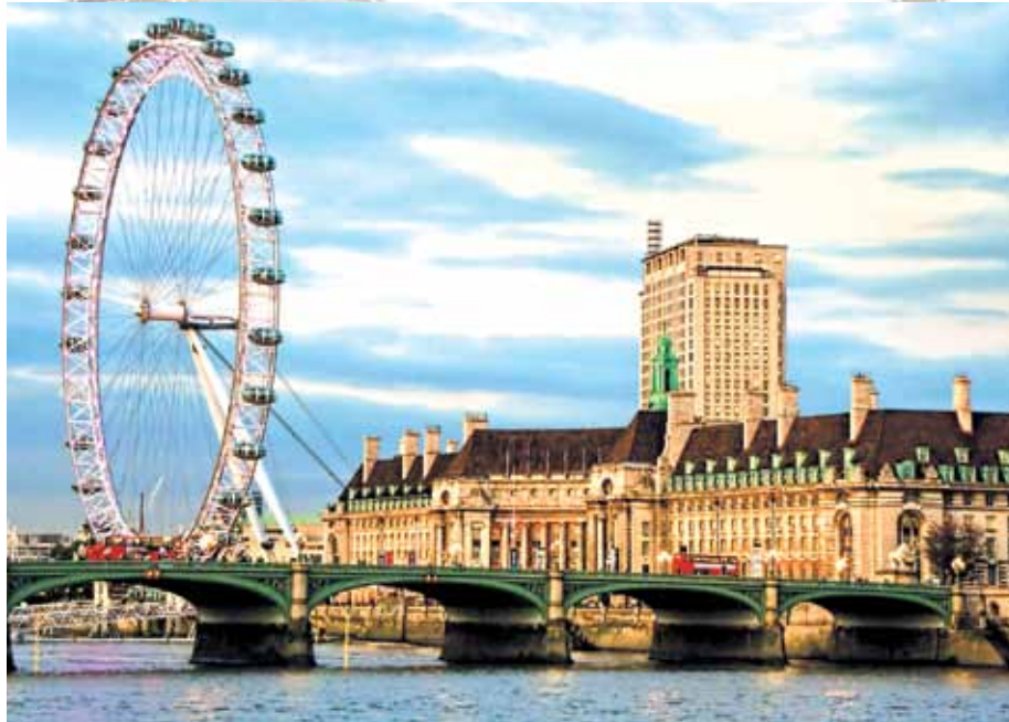
Spectacular, London Eye