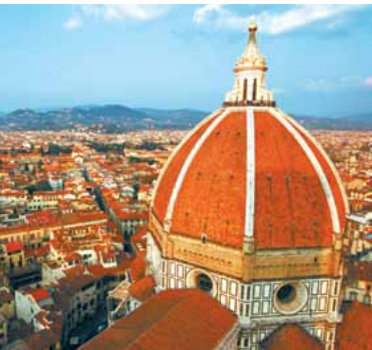
Duomo – Florence

“Gates to Paradise”, the Campanile and marvel at the open air sculpture museum in Piazza Della Signoria and many more sights. Also see the Ponte Vecchio - a medieval bridge over the River Arno. Get a bird's eye view of Florence from Piazzale Michelangelo where you can also see the statue of David, one of Michelangelo's masterpieces.