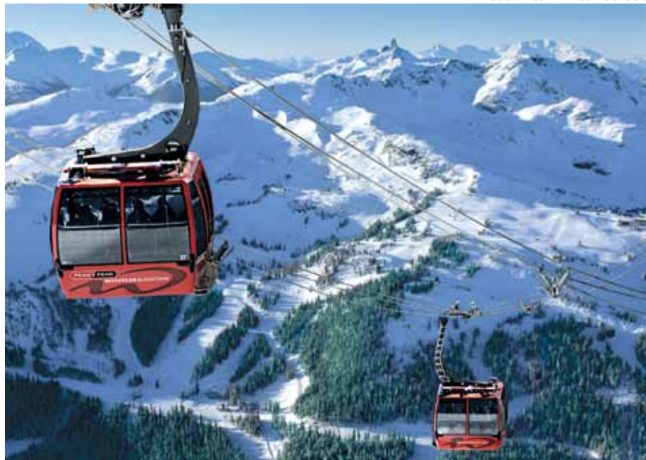
Whistler - Peak 2 Peak Gondola

After an American breakfast at the hotel, check out and drive to the spectacular