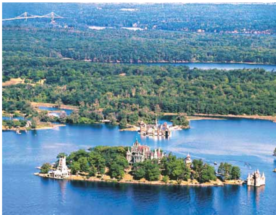
1000 Islands – Scenic archipelago in the St Lawrence River

the Rideau Canal Locks. Later, proceed on a guided city tour of this magnificent Canadian capital. Tonight, enjoy an Indian dinner. Overnight at hotel Delta Ottawa Centre or