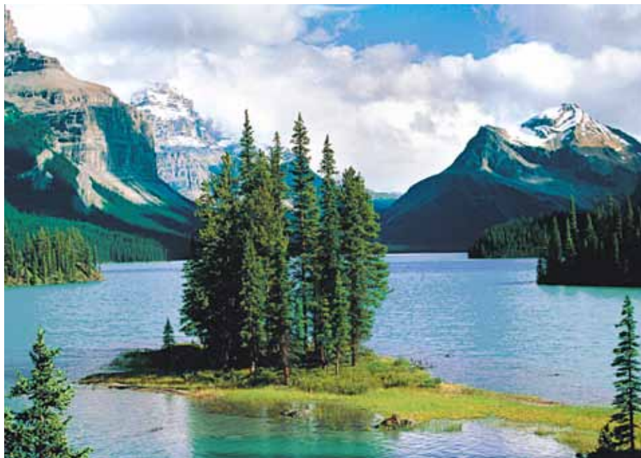
Jasper National Park

Enjoy one of the most scenic drives in the world - along the Icefields Parkway - a region with spectacular scenery, from glaciers to waterfalls. Later, get set for the highlight of your