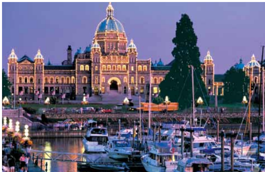
Victoria – British Columbia.

After an American breakfast on board, proceed to the airport on your own for your flight back home. Return with wonderful memories of your holiday with Airtours Holidays