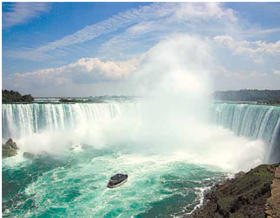
Breathtaking Niagara Falls