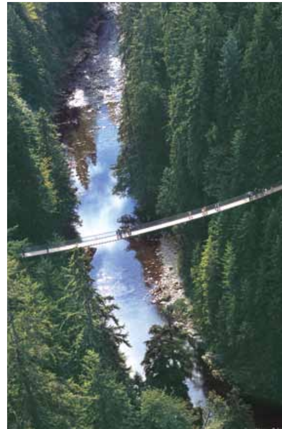
Capilano Suspension Bridge, Vancouver

After an American breakfast at the hotel, proceed on a guided city tour. Visit the Stanley Park – an evergreen oasis of 400 hectares. See the Canada Place, Robson Street, Chinatown, Gastown and many more sights on your tour. Visit the Capilano Park which houses the famous Capilano Suspension Bridge - originally built in 1889, it stretches 450 feet (137m) across