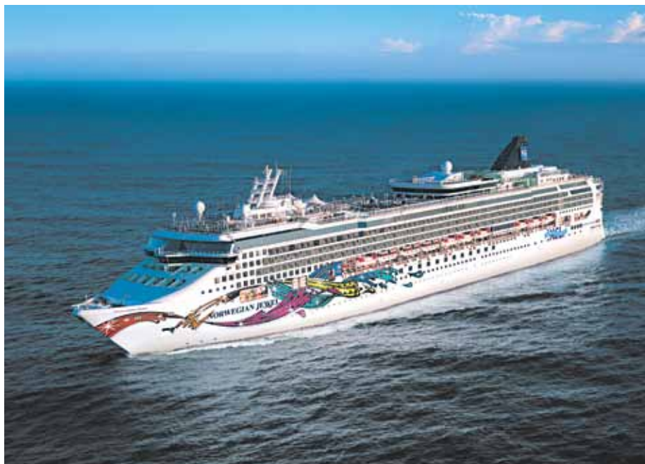
'Norwegian Jewel' luxurious cruise to Alaska

After an American breakfast enjoy the day sailing along the spectacular Inside Passage. Today indulge in the fun