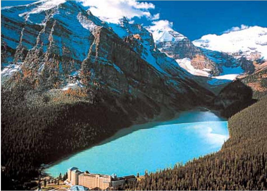
Spectacular Lake Louise

After an American breakfast at the hotel, proceed to Quebec – Canada's