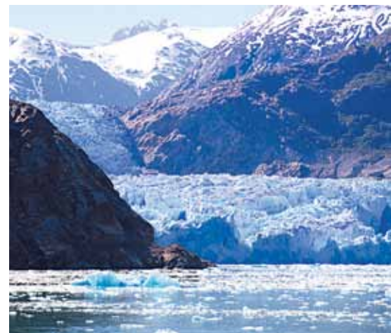
Glacier Bay – Alaska

you get up close to the twin Sawyer Glacier. If you are lucky you can also experience the calving of the glacier.