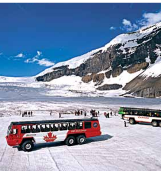
Columbia Icefield – Athabasca Glacier

world - along the Icefields Parkway - a region with spectacular scenery, from glaciers to waterfalls.