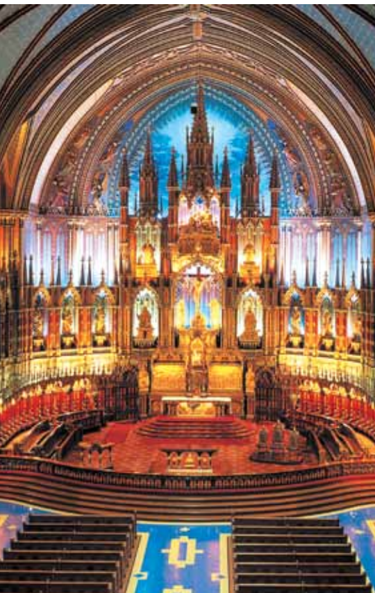
Notre Dame Cathedral – Montreal

the base of The Horseshoe Falls – the largest of the three Falls. (Due to weather conditions, this ride operates from the last week of May).